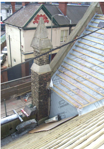
Re-slatting the roof

The new mezzanine floor creates extra space, with a welcoming entrance and dedicated creche area below.