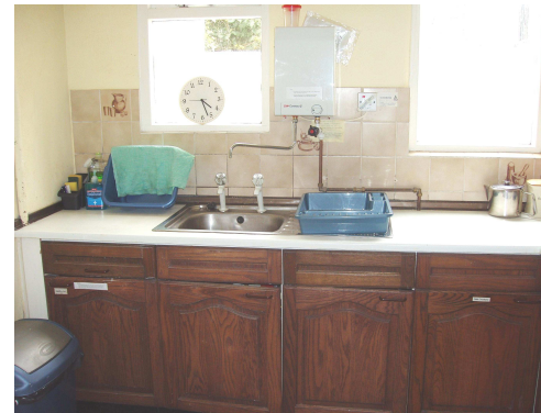
The Kitchen before...